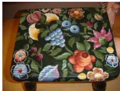
Nov 10 3 hour Paint-In