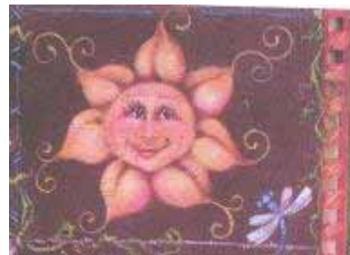
October 13 6 hour Workshop