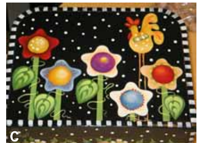
July 14 6 hour Workshop