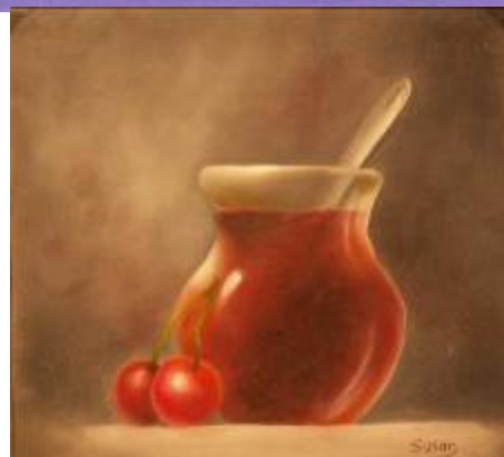
March 3 hour Paint-In