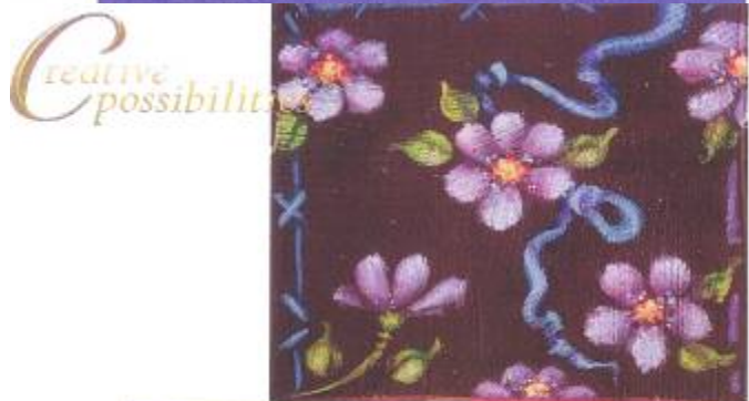
Lesson 3: Daisies and Leaves