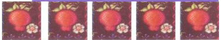
Lesson 4: Strawberry & Blossom