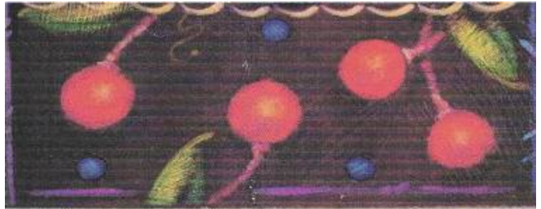
Lesson 2: Cherry & Dots